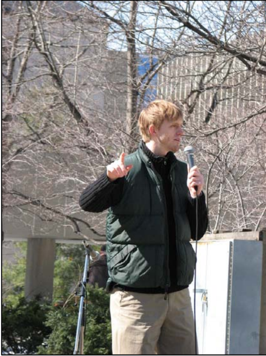
Speaking at a climate change rally in Nathan Phillips Square

These individuals and many others are able to come together for this cause for two reasons. One, because the Green Party's vision for Canada transcends old-line politics, and presents a new proposition for voters tired by the left/right battles of the past. And two, because this by-election represents a unique opportunity.